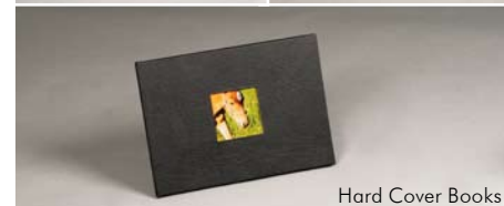
Hard Cover Books