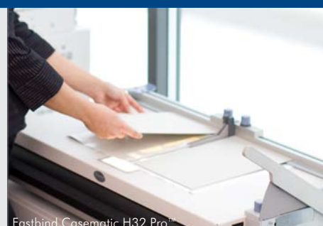
Fastbind Casematic H32 Pro™

The BooXTer Duo features a special built-in casing unit to easily attach the hard cover to the pre-bound contents. You insert the cover in the groove to maintain it and just peel-off the end-sheets with your free hands.