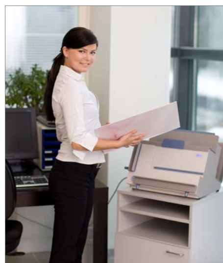
You bind professional books, reports or photo albums in a few seconds.