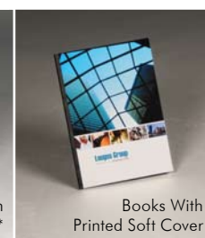
Books With Printed Soft Cover