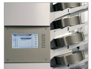
ACF 510 display and fan