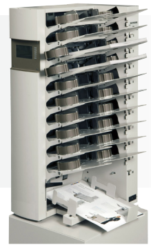
AC 510 with air separation

High capacity user friendly range of feeders & collators for digital and litho printed applications.