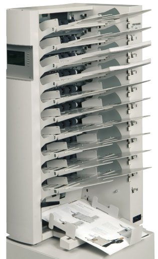
C 510 without air separation