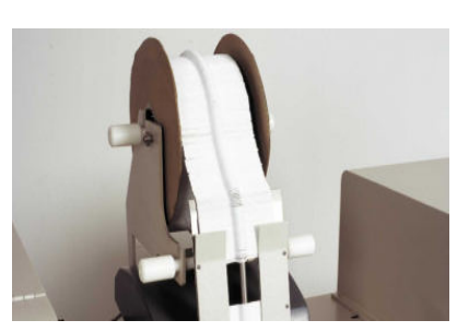
Optional hanger spool holder for reeled pre-formed hangers