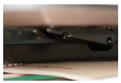
Wire-O® closing area with autocentering of bound document