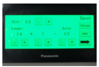
Touch screen interface